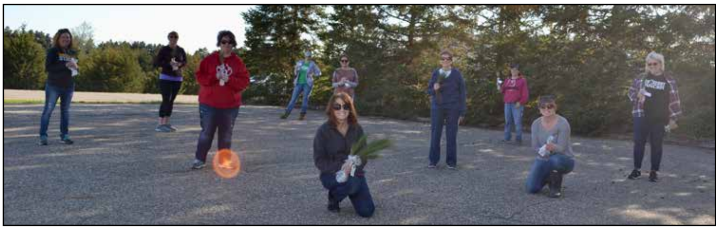
Jordaness club members practiced social distancing as they prepared for the project!