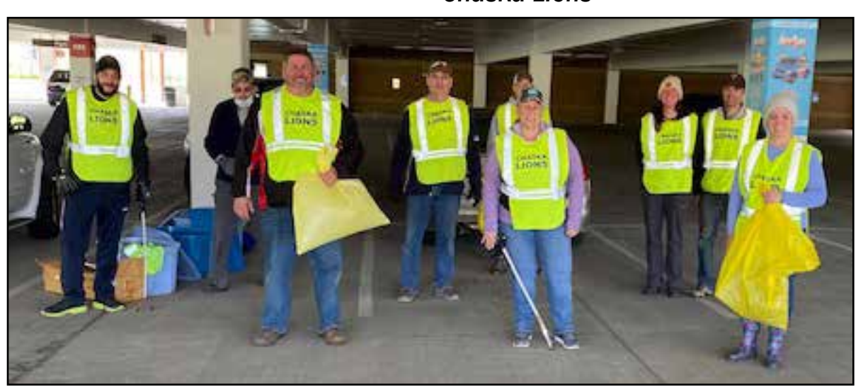
The Chaska Lions performed their semi annual Roadside Cleanup recently. Photo of the volunteers nearly practicing social distancing!